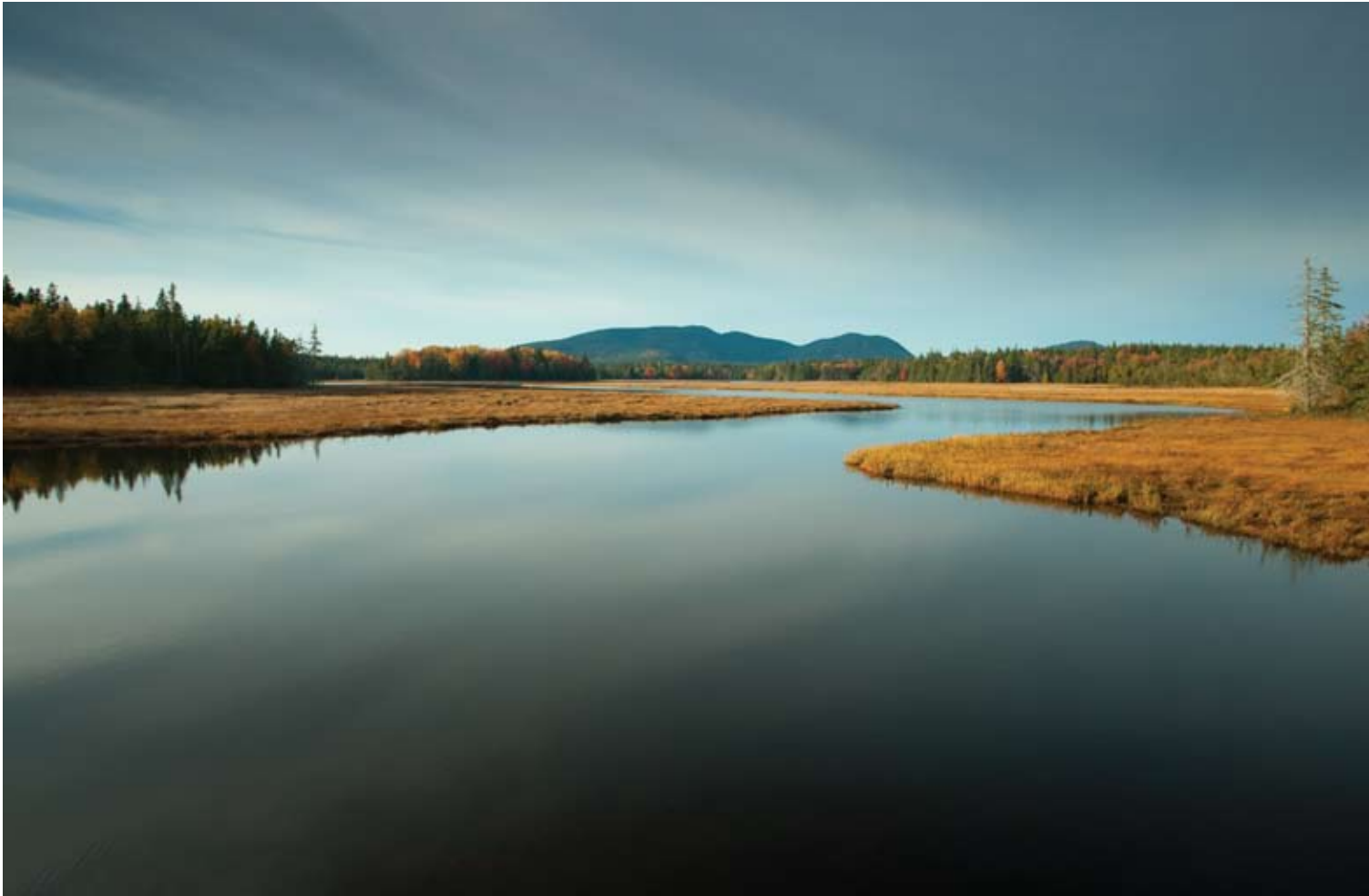
Bass Harbor Marsh (looking toward Bernard Mountain and Mansell Mountain)