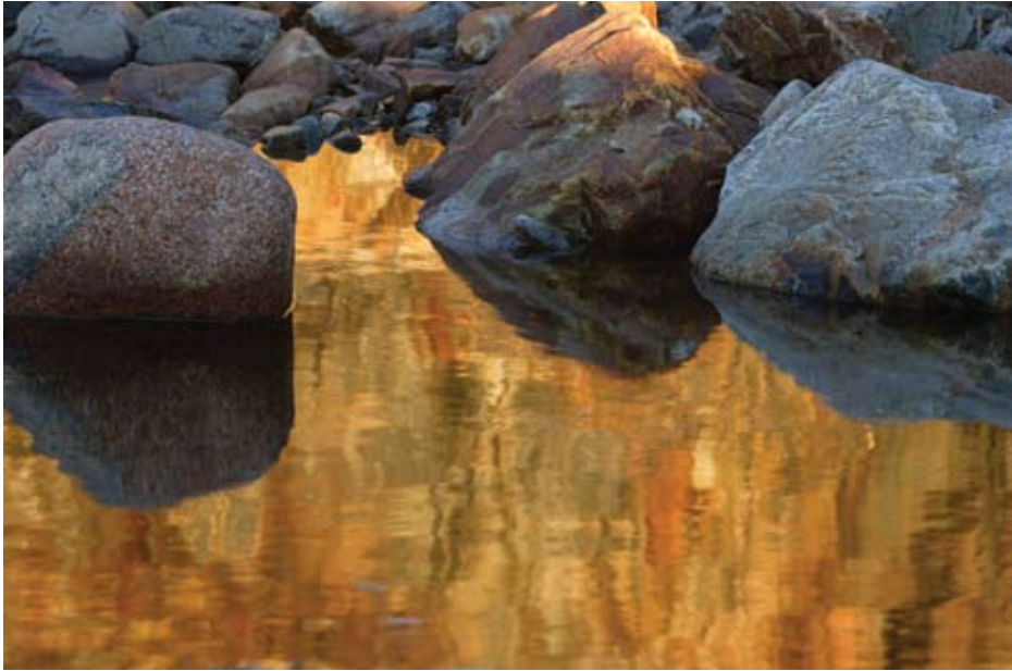
Liquid gold, Hunter's Head