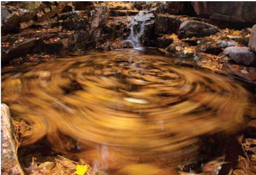
Twirling leaves in Whitecap Stream

Acadia National Park is an environment known and loved by the people of Maine and beyond. In the fall, when the colors turn, visitors flock to Acadia to take in the fleeting beauty we locals sometimes take for granted. Michael Hudson is among the photographers who take this annual pilgrimage. The magical quality of these photographs comes from a careful read of the water and Hudson's ability to capture the essence of the moment. Through his lens, "still" is profoundly quiet and "moving" is alive. Both extremes remind us that a photograph can give us more than a mere snapshot of the landscape; it can breathe on the page.